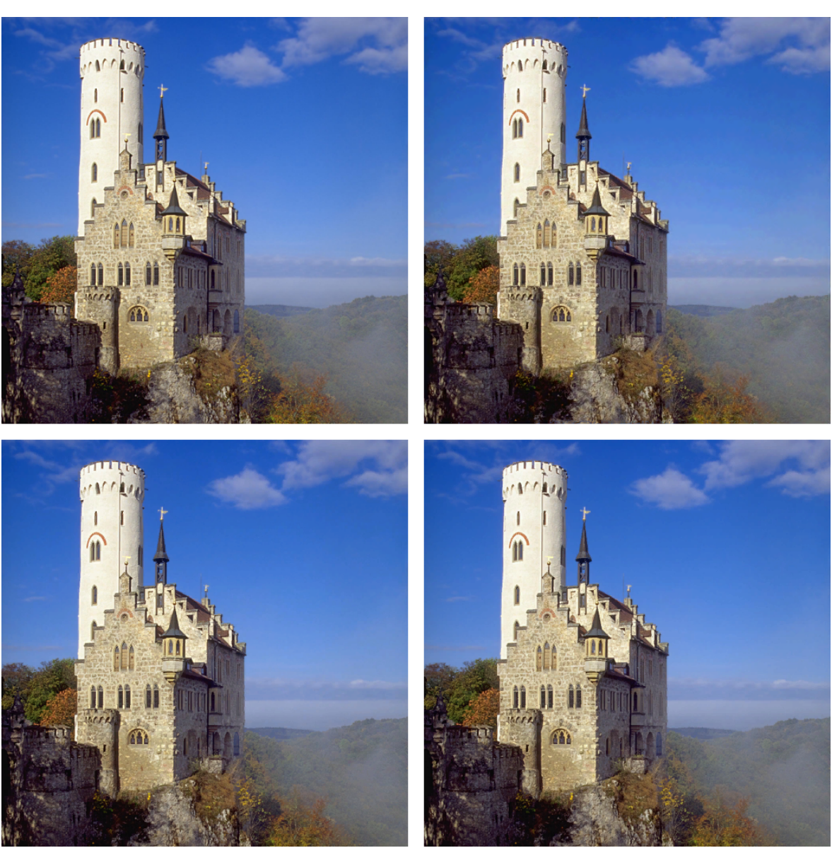
Figure 2. Original (top left), encoded with PVRTC (up right), encoded with squish (bottom left) and with line matching (bottom right).